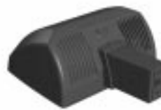
FPSARM Pole Arm