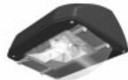
FPSSHIELD Lens Shield